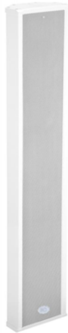
Material: Aluminum and ABS plastic