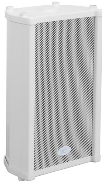
Aluminum and ABS plastic