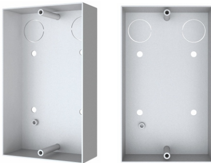
Hole size(LxWxD):126x75x31 mm