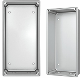
Material: Aluminum Mounting Box