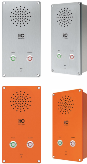
Default color is gray, orange color is Optional.