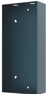
Surface Mounting Box T-6719