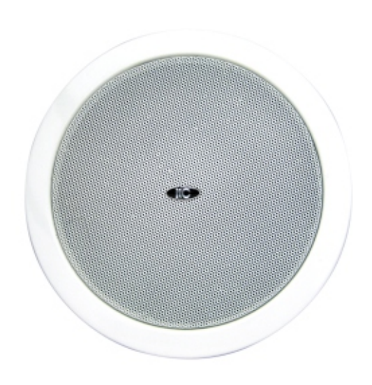
Material: iron mesh cover