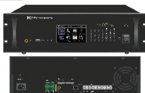
T-78240 / T-78350 / T-78500